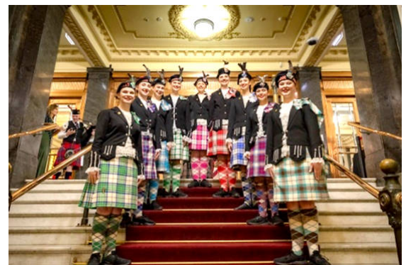
Highland dancers welcome guests to Melbourne Town Hall