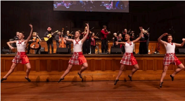
Royal Scottish Official Board of Highland Dancers