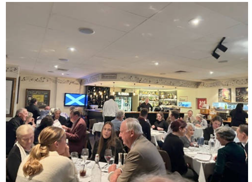
Robert Burns Supper, Il Duca Restaurant