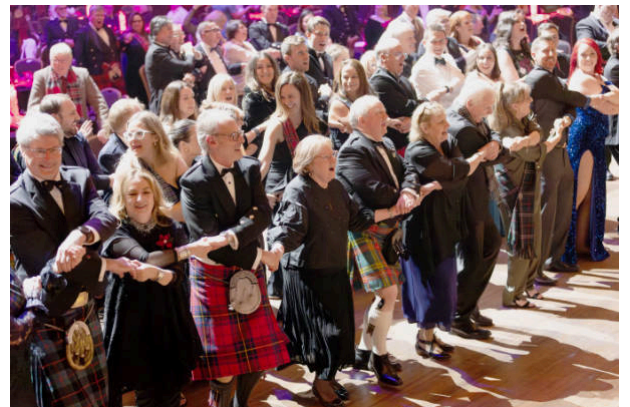
Guests on the dancefloor, MTF Gala Dinner &