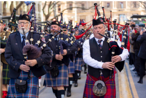
Melbourne Tartan Day Parade