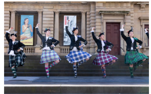
Right: Highland dancers on the steps of Old Treasury Building