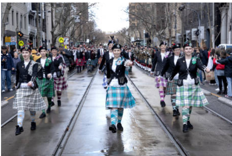
Highland Dancers, Clans & 200+ massed pipe bands on Collins Street, Melbourne Tartan Day Parade