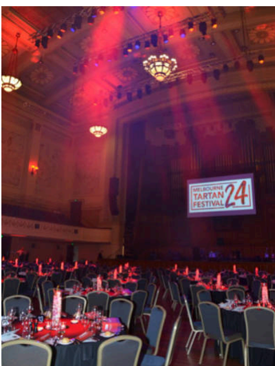
MTF Gala Dinner & Concert, Melbourne Town Hall