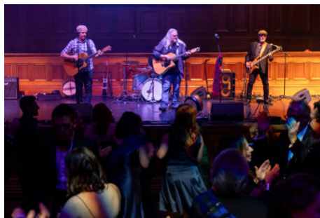
Celtic rock band Claymore, Melbourne Town Hall