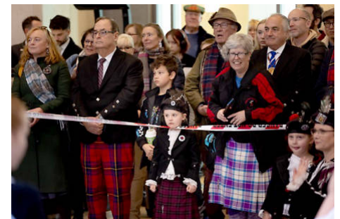
Melbourne Tartan Day Parade spectators