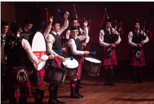
Left: Old Scotch Pipes & Drums at MTF Gala Dinner & Concert