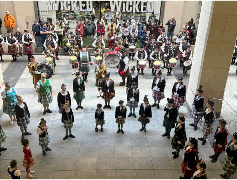
The Westin Melbourne massed pipe band & highland fling recital