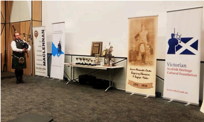
Victorian Pipers Association Solo Piping Championships