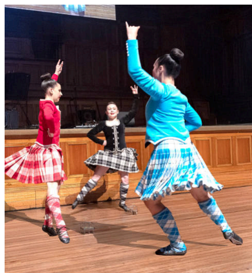
The sword dance, MTF Gala Dinner & Concert