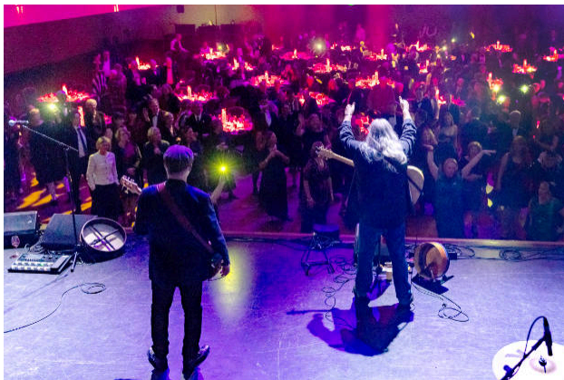
Celtic rock band, Claymore - MTF Gala Dinner & Concert