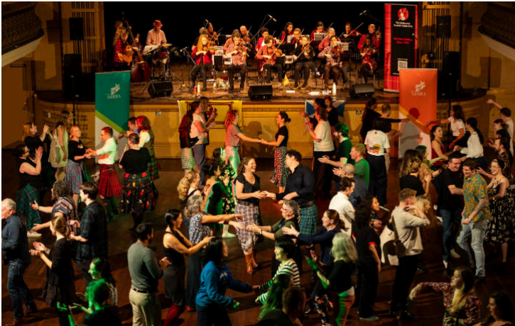
MTF Ceilidh Dance at Collingwood Town Hall